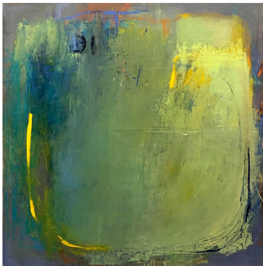
Vessel Series #1.

Writers can just lie and distort. The lid to the cake is lifted and instead of a cake there is a million dollars. Paintings I enjoy most, like yours, find a fuzzy grace the everyday. I'm not drawn much to photorealistic paintings. I mean, we've got cameras.