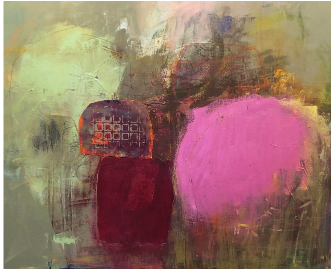
Big. Pink. Bang.

Haruki Murakami's books, almost any of them. His prose is like a crystal clear stream, but his plots are convoluted, surreal, and almost science fiction-y. Start with the short novel Kafka on the Shore , or jump into his latest long one, Killing the Commendatore .