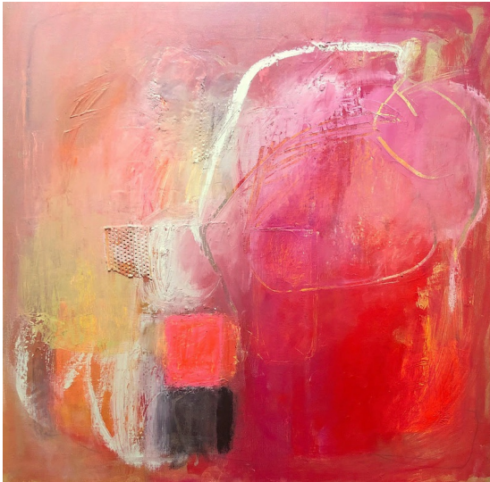
Dreaming in Red

That's what I love about art. We cannot master it, ever. Or others say we have, but we know we haven't gotten close to what is possible from ourselves. Over the decades how have you seen your own work grow? Has anything gotten easier?